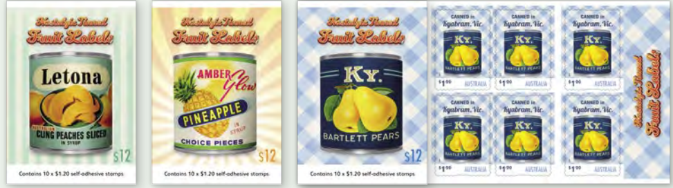
2214250 Leeton, NSW