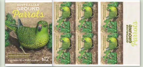
$12 each S/A booklet 10 x $1.20